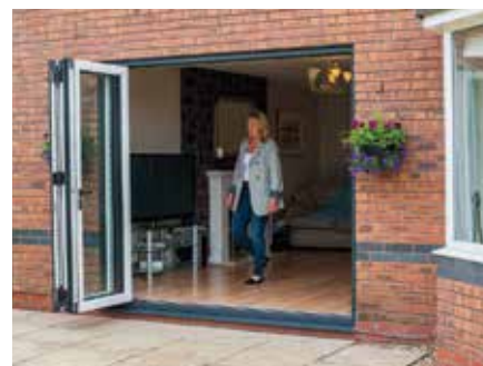
The Imagine Bi-Fold Door makes an attractive alternative to a traditional sliding patio door; completely opening your home up to the garden or patio.